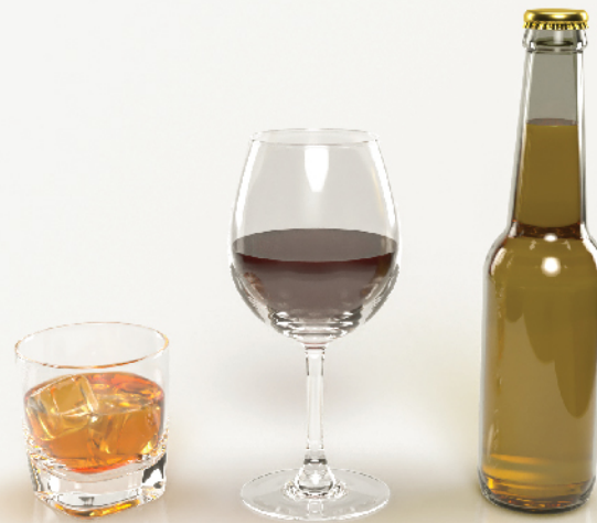
Spirits 1.5 fl oz

Most people think the difference is solely based upon body weight, but this is only one factor. Females have less water in their bodies. Therefore, if a female and a male of the same size and weight drink the same amount of alcohol, a female is likely to reach a higher concentration of alcohol in her blood.